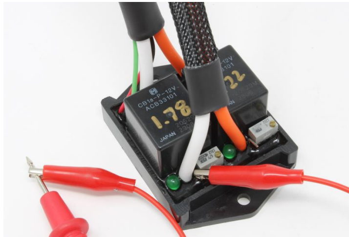
Photo 1. Positive voltmeter lead is attached to the adjustment pin for the adjacent relay. Connect the voltmeter negative lead to ground.